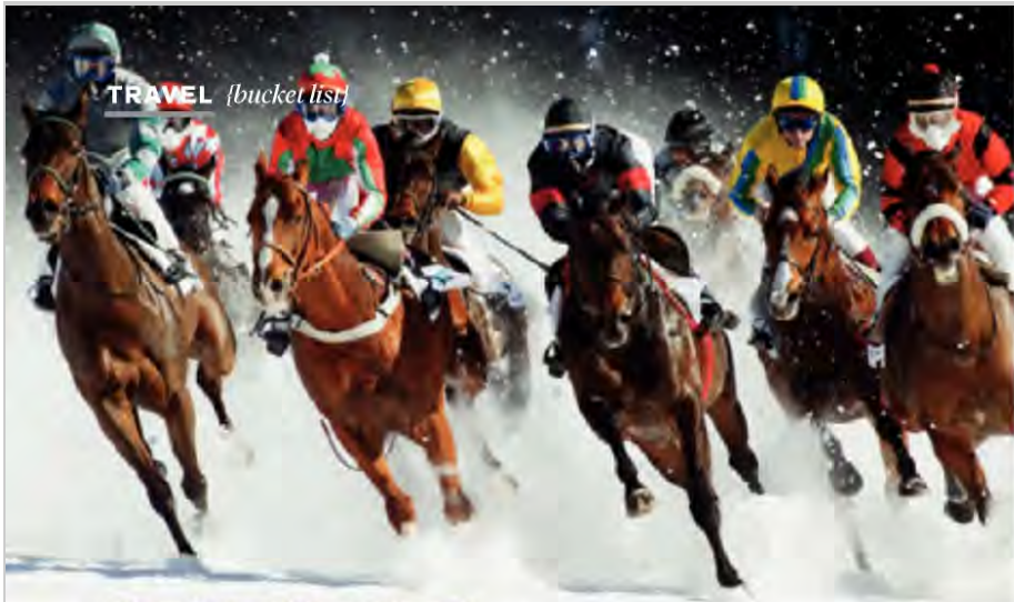
(from top to bottom) And they're off, at the White Turf race in Switzerland; a treatment room at Abu Dhabi's Anantara spa; unusual food at Ultraviolet in Shanghai; the restaurant's dining/projection room.