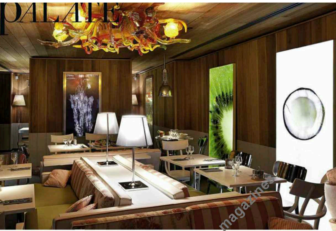
PHILIPPE STARCK'S INTERIOR FOR LE PARADIS DU FRUIT ROOTS, LEFT, IN PARIS, MERGES THE WARMTH OF A LOG CABIN WITH A SPLASH OF VIVACIOUS COLOUR COURTESY OF A MEDUSA-LIKE, FRUIT-SHAPED GLASS CHANDELIER. THE RESTAURANT, KNOWN FOR ITS FRUIT AND ICE-CREAM BAR, ALSO SERVES HEALTH-CONSCIOUS SALADS AND SUSHI. 10, BOULEVARD DES BATIGNOLLES, 17TH ARRONDISSEMENT, AND OTHER PARIS LOCATIONS.