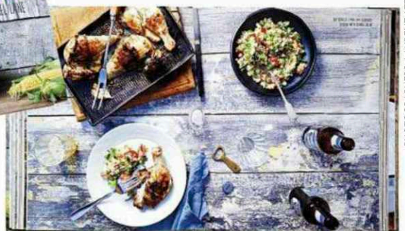
PRODUCER/TEXT: CONOR BURKE

THE SOCIAL STYLE OF DINING SYNONYMOUS WITH ARGENTINIAN AND BRAZILIAN CUISINES IS BEAUTIFULLY CAPTURED IN RACHAEL LANE'S SOUTH AMERICAN GRILL (HARDIE GRANT, $40). THE COOKBOOK SHOULD HAVE YOU ABANDONING YOUR STOVE TOP IN FAVOUR OF THE PLEASURES OF AN OUTDOOR BARBECUE IN NO TIME.